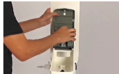
Hook dispenser on screws and tighten with screwdriver