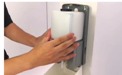
Insert sanitizer tank into the holder and fill with sanitizer