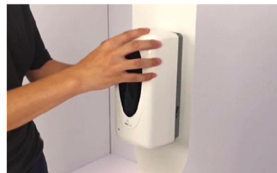
Close dispenser cover