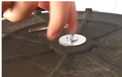
Use M8 X 30mm screw and washer to attach base to support tube