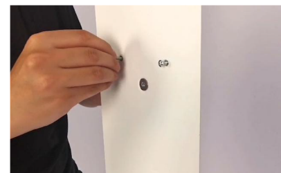
Screw M4 X 16mm screws partially into back tray