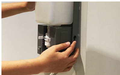
Insert (qty 4) C batteries and turn on power switch