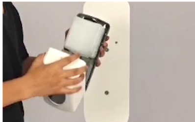
Pull open dispenser cover