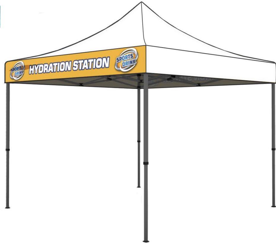
2 PRINTED VALANCE GRAPHIC OPTION