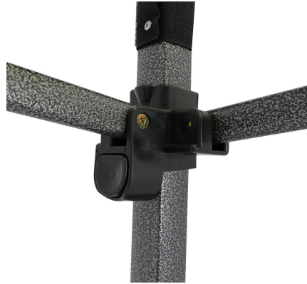
Corner Thumb Lock

Spring loaded support pole keep tent tops centered on frame