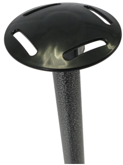
Peak Support Pole

Spring loaded support pole keep tent tops centered on frame