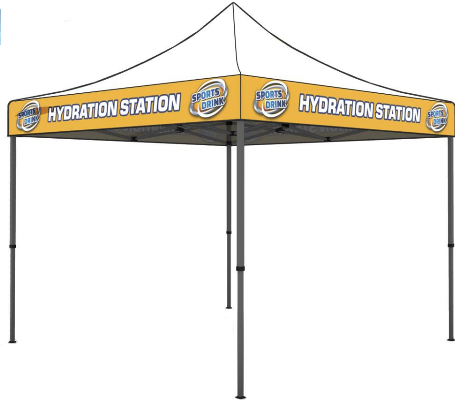
4 PRINTED VALANCE GRAPHIC OPTION